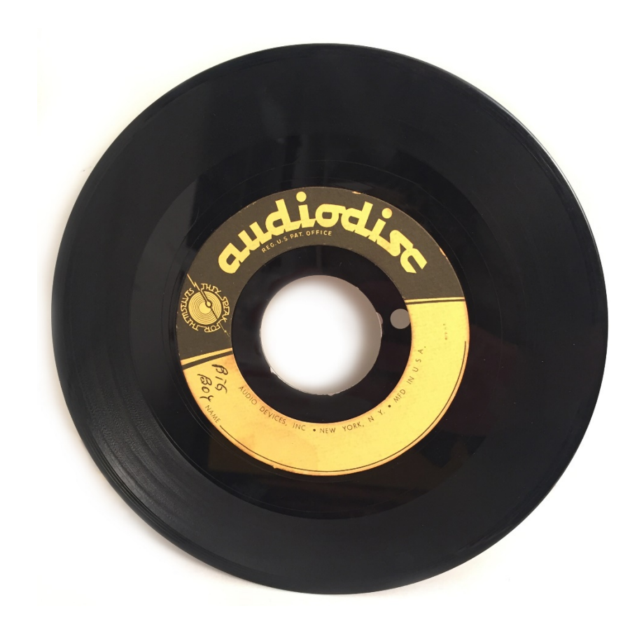
Lot 44: The Jackson 5's First Acetate Pressing. Singles featured are: "Big Boy" on Side 1, "Some Girls Want Me for Their Lover" (also known as, Michael the Lover).