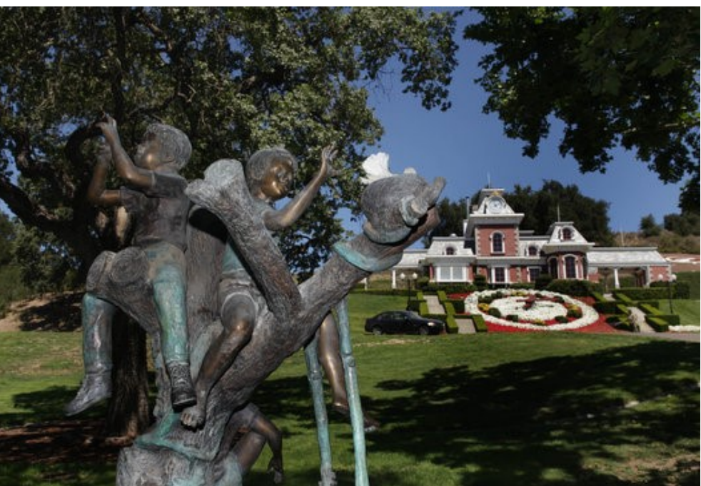
Additional press images: Bronze sculpture on the grounds of Jackson's Santa Barbara county fabled ranch and private amusement park.